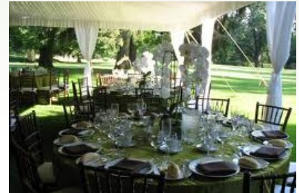
A nicely decorated Tent is great if you want an indoor feel