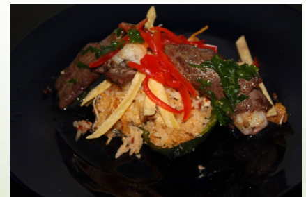
Fire up your grill for a tasty meal!!!