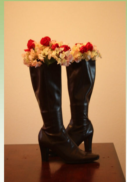
Can you believe these were found at Goodwill?

Décor can be one of the most rewarding parts of your party. Getting creative on a budget with the results looking as though you spent a fortune feels fabulous!!! Pinterest is perfect for just this! Places like Goodwill, the salvation army, estate sales and craigslist are just a few places where treasures can be discovered. Using empty wine bottles, corks, and recycled beautifully patterned materials can provide an environmentally friendly gorgeous display.