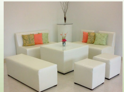
Lounge furniture that comes in several different color combinations. And some of them glow too!

Rentals can really spruce up your party and offer your guests a place to eat, or gather around for conversation. For a cocktail style party, cocktail tables are great. You don't have to worry about renting chairs and it keeps your event fluid, with guests moving about and getting to know each other, rather than sitting in one place for the entire event. There are many different types of rentals to choose from depending on your preference from lounge furniture, tents, lighting to chafing dishes, china and linen.