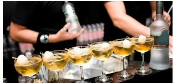
Refreshments for you guests!!!

An open bar can be the difference between a hoppin' party with your guests tearing up the dance floor, or everyone seated and separated, reminiscent of a junior high dance. It is not necessary, but can be a fun option, depending on your preference. Choosing a signature drink or two, that can be pre-prepared and in an eye-pleasing container with colorful fresh fruit, will offer décor and libations for your event. If you want to take it a step further, hiring a bartender is a great addition. Bartenders are great with your guests and fun to watch as they make the cocktails.