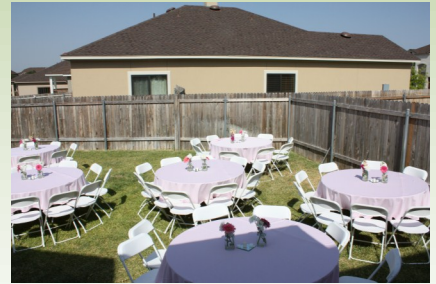
The Backyard can make a great venue!

Catering can be really expensive, one way to cut the cost is to create a menu based on what's in season, on sale and what can feed several people at low cost. Pastas can make a great solution and depending on how it is prepared it can be a colorful addition to your décor. Heavy hors d'oeuvres like bruschetta are delicious and the ingredients well priced. If you want to get creative, use a website like allrecipies.com to search by ingredients on sale or already in your pantry to get a list of your options One thing I do is every time I go shopping for my house, I will collect the on sale meats to freeze, so anytime people come over, I don't have to go to the store, but just defrost and grill, makes for an easy impromptu event. Potluck is also a great option as well.