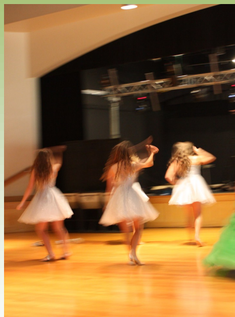
Get your guests out on a dance floor, any space will do.

Let's get this party started with some dancing or performing. A DJ or live music can be great for party and they are very reasonably priced if you research. Some DJ's offer other services, such as rentals that they would be willing to bundle at a lower price. There is also the option of having entertainment for only a portion of your soiree, then using your mp3 playlist for the remainder of your event. Just make sure you speak to, or better yet invite your neighbors so that the music does not bother them.